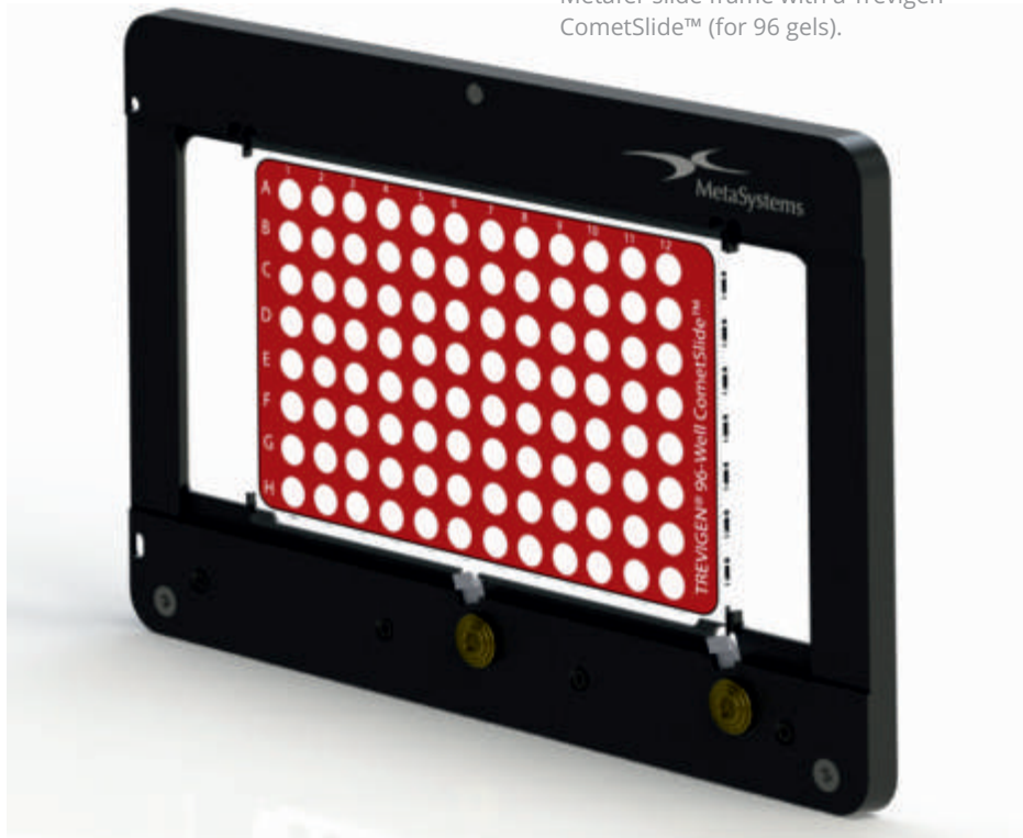
Metafer slide frame with a Trevigen™ CometSlide™ (for 96 gels).

Metafer is a highly versatile slide scanning platform, which bears many advantages for the setup of high-throughput routine Comet assay workflows. Metafer's fast and flexible slide scanning stage can be adapted to many different sample layouts and, thus, facilitate the analysis of multi-gel plates such as the Trevigen™ CometSlide™. The various options to adjust and then standardize a workflow make Metafer the perfect tool to steadily generate highly reproducible data. The SlideFeeder x80, a modular system to increase throughput capacity of any Metafer system, can be used with standard slides as well as with large multiple gel plates. It handles up to 800 slides, up to 88 full-size plates, or even a mix of different samples. Metafer's robustness and the possibility to prioritize samples using the bar code reader make the system the perfect service for routine 24/7 imaging.